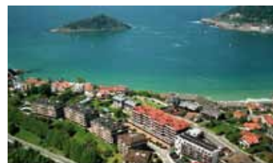
Paseo del Duque de Baena, 42 20009 San Sebastián

In short, it is an exceptional place for research staff who will work in an R&D and innovation centre in the city, as employees or visitors, and who will participate in, at least, one dissemination activity in their knowledge area in collaboration with Fomento de San Sebastián.